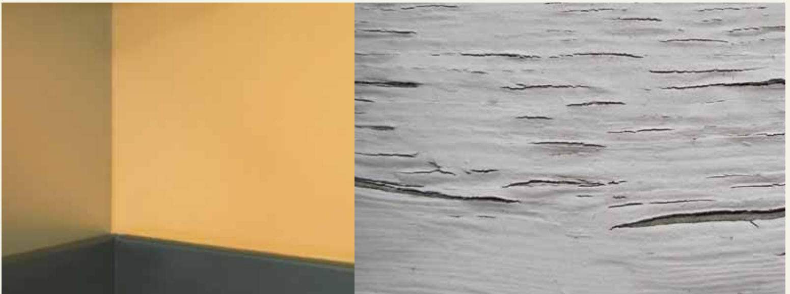
Table adapted from the National Parks Service Historic Preservation Brief #10 "Exterior Paint Problems on Historic Woodwork", available at www2.cr.nps.gov/tps/briefs/brief10.htm and used with kind permission.